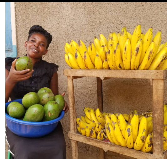
Assumpta's Fruit Stand